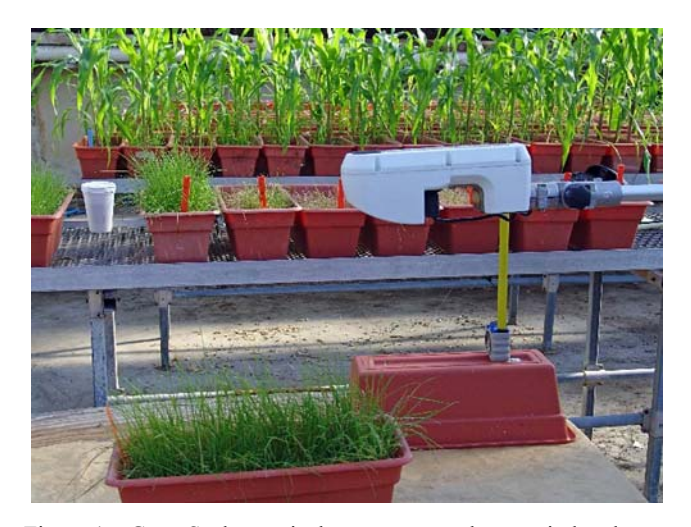
Figure 1 GreenSeeker optical sensor scanned over window boxes planted with ryegrass at various heights and orientations. The resulting NDVI values were automatically recorded to a PDA connected to the optical sensor.

A GreenSeeker handheld optical sensor (Model 505, NTech Industries, Inc., Ukiah, California) was suspended at five different heights (30.5 cm (12"), 61.0 cm (24"), 91.5 cm (36"), 121.9 cm (48"), 152.4 cm (60")) above 45.7 cm×19.1 cm (18"×7.5") window boxes (Model DCB18 TC, Duraco Products Inc., Streamwood, Illinois) planted with fourteen day old ryegrass (Figure 1). Six different window boxes planted with ryegrass were used for this study. Kraft paper was placed beneath the window boxes to provide a uniform background for the scans. The sensor was passed over each window box, parallel to the ryegrass canopy, five times at each of two orientations (Figure 2) and at a speed of 15 cm per second (6" per second). The resulting NDVI values were calculated from the red (660 nm) and NIR (770 nm) bands and automatically recorded to a personal digital assistant (PDA). All scans for the study were conducted within a 60 minute timeframe, thus ensuring minimal variation in ambient conditions. Since individual window boxes were situated over a uniform background and the light beam extended beyond the extents of the window boxes, only the maximum NDVI values for each